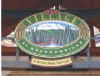
Base of Peak 9 FSC Trip